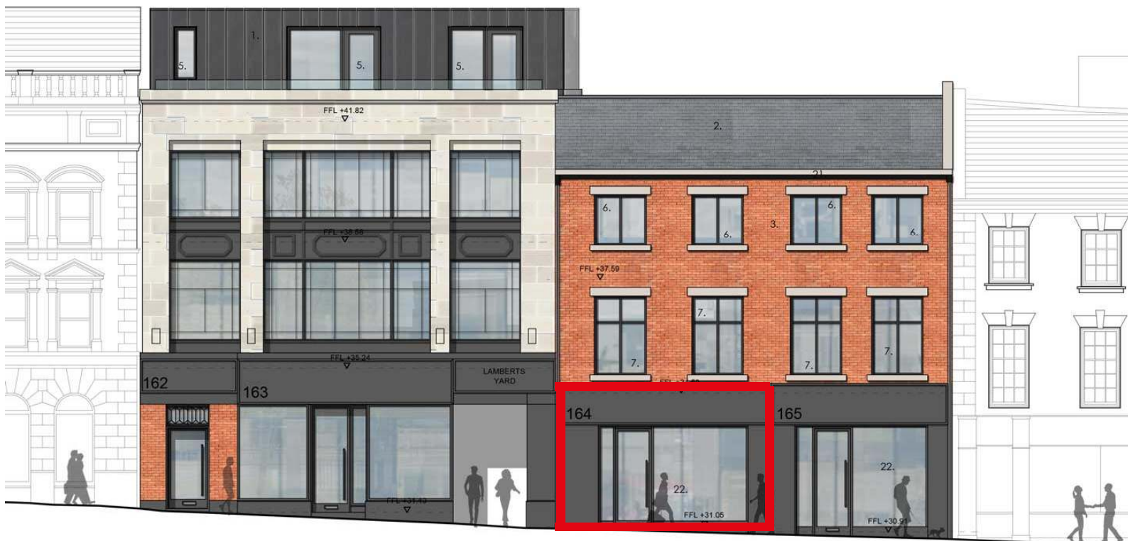
*CGI image of subject premises highlighted in red